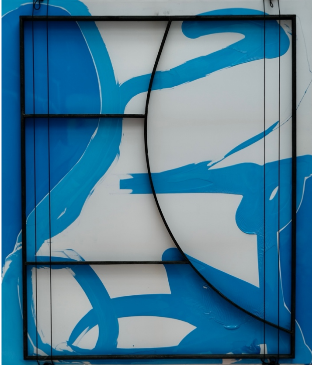
INTERNATIONAL TOPLAC PLUS, 2023

Toplac on samba, steamed and burned Norwegian pinewood, elastic strings, angle iron, 186,5 x 161,5 cm