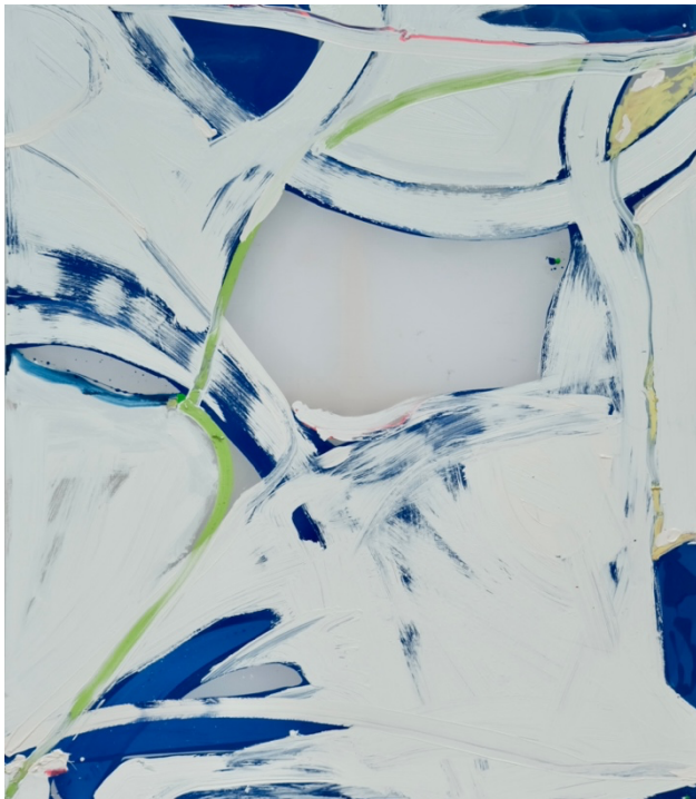
RIPSTOP COVER UP 1/2, 2023