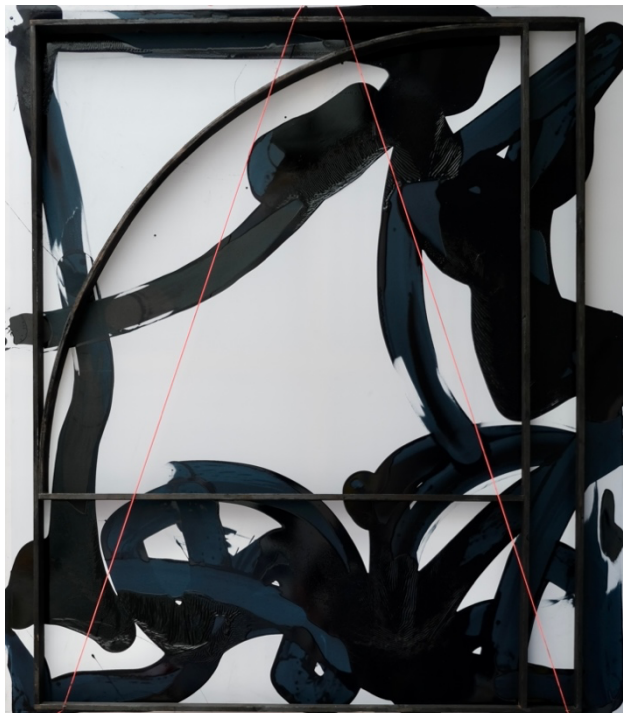
INTERNATIONAL TOPLAC PLUS 2, 2023

Toplac on samba, steamed and burned Norwegian pinewood, elastic strings, angle iron, 182,5 x 161 cm