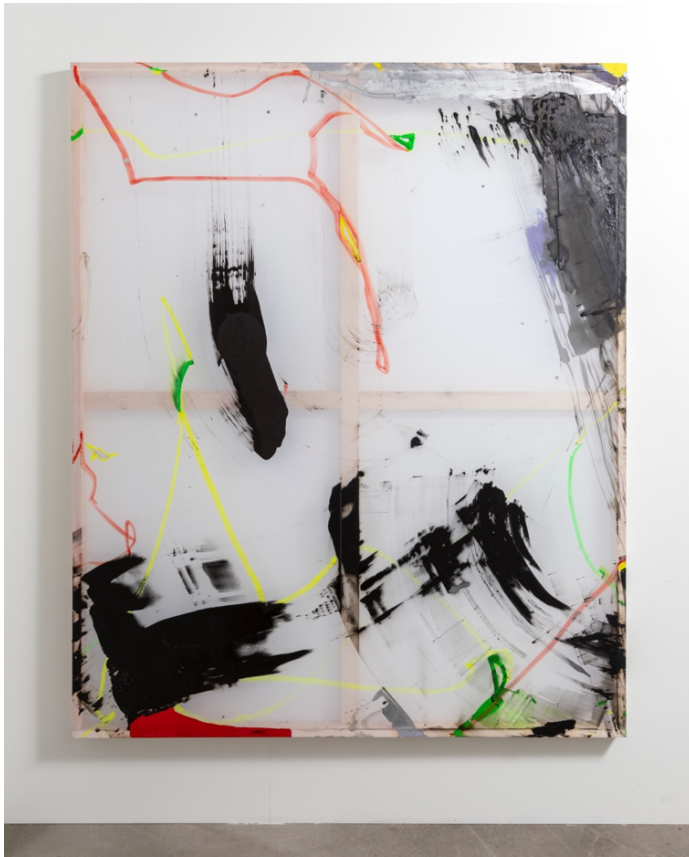
SOFT ON SOFT, 2021

Oil, acrylic, soft wax, print ink on mesh,