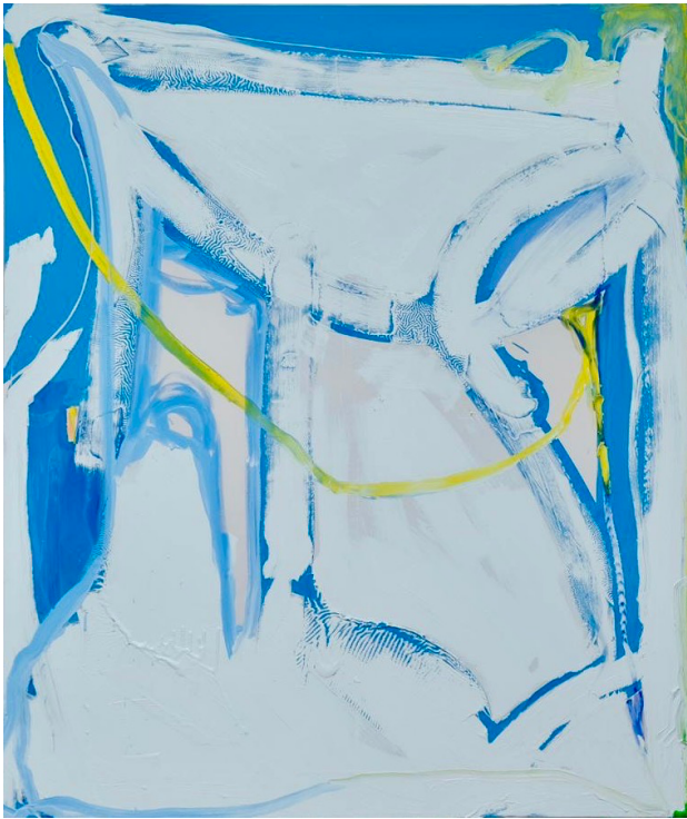
TOP COVER UP/ IT'S A LOOP, 2023

Toplac, oil, soft wax on samba, 173 x 146 cm