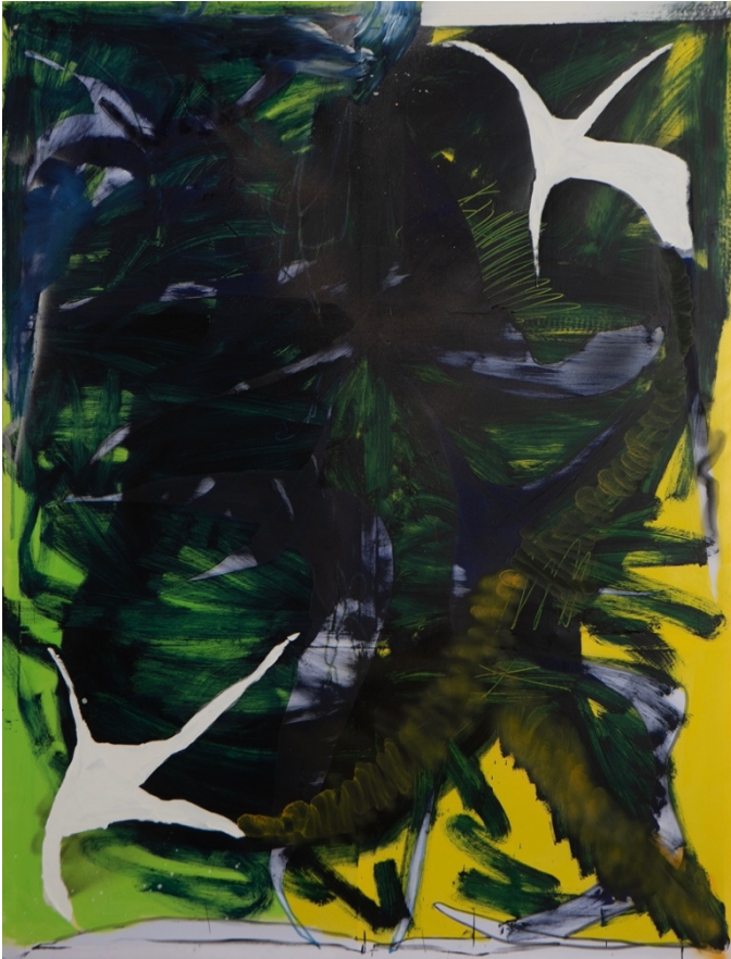
LITERS OF BREEZERS, 2021