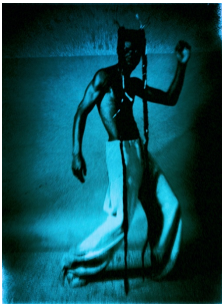
ELEMENT EARTH, 2023