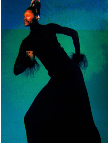
ELEMENT FIRE, 2023