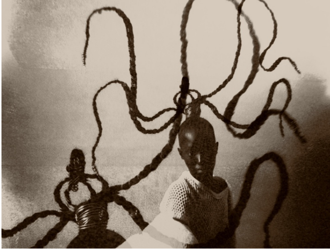
ELEMENT AIR, 2023 Photography, 30 x 40 cm 95 EUR