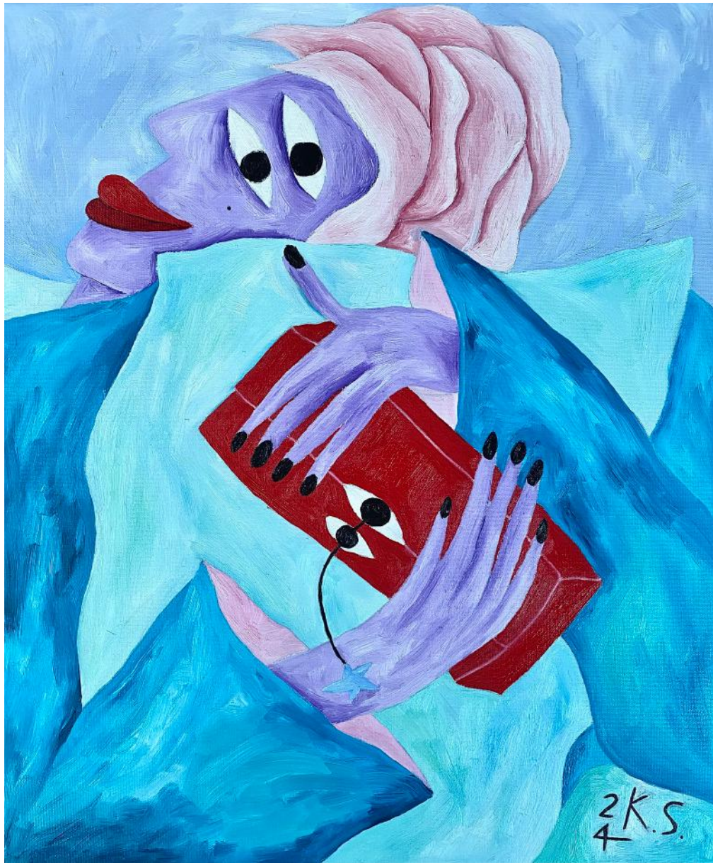
Persona, Grateful (2024)