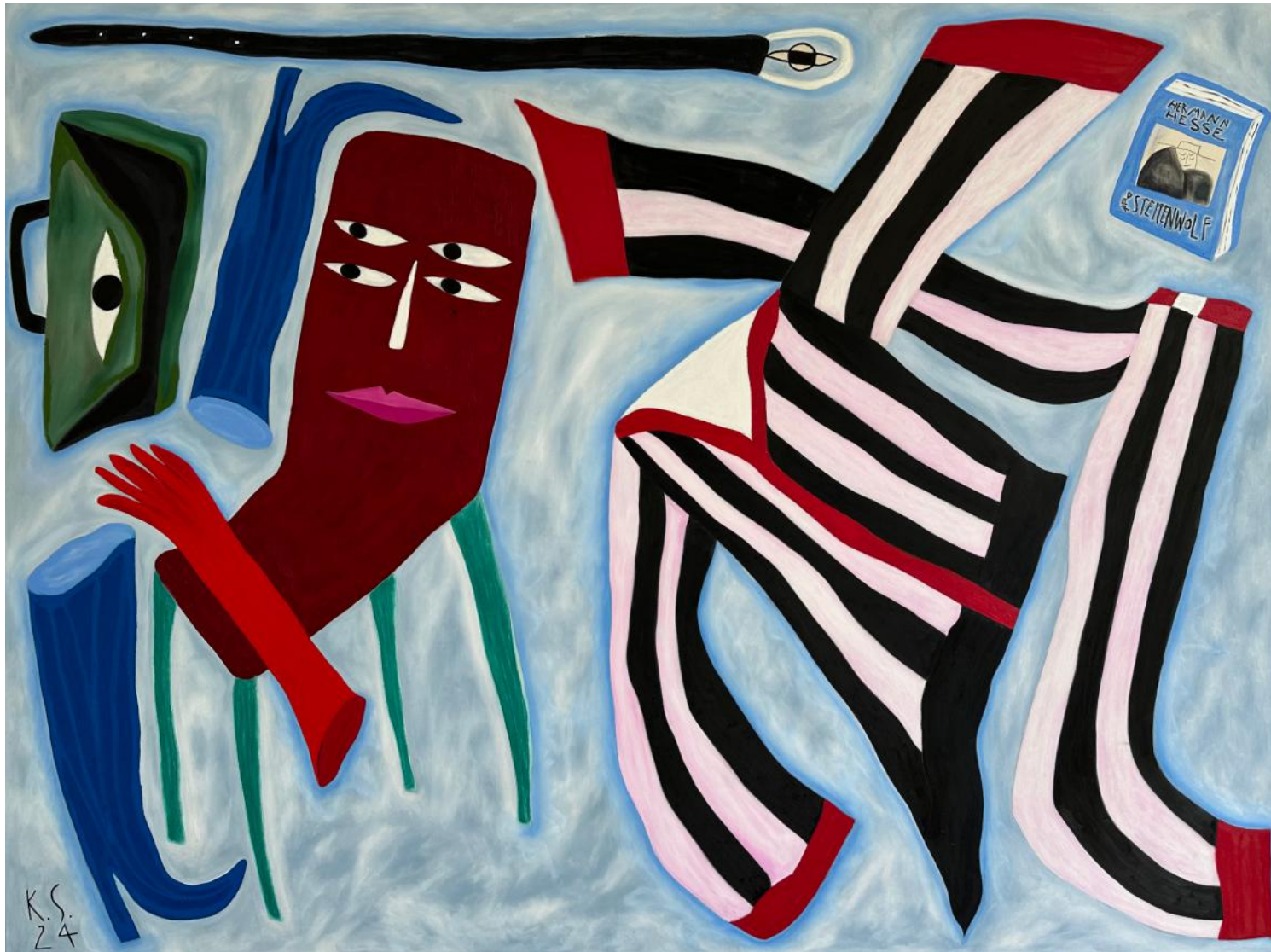
Belongings of Persona (2024)