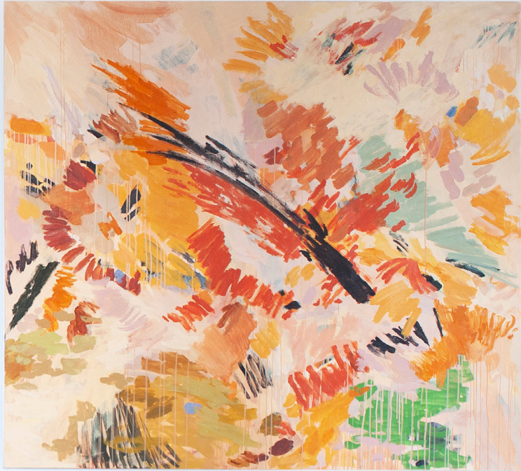
Dickicht 4 * 200 x 180 cm Acrylic on canvas, 2023 EUR 6,500.00 incl. VAT *sold